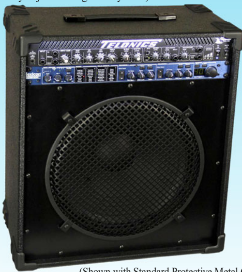
(Shown with Standard Protective Metal Grill)